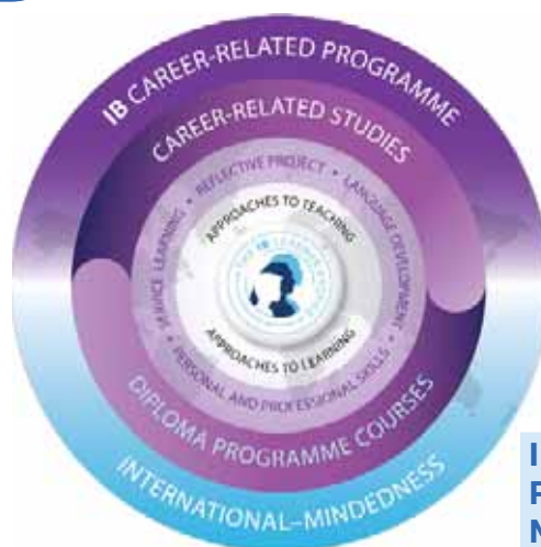
IBCP PROGRAMME MODEL

For IBCP students, both the Diploma Programme courses, and career related study provide the theoretical underpinning and academic rigor of the programme; and the IBCP core helps them to develop skills and competencies required for lifelong learning.